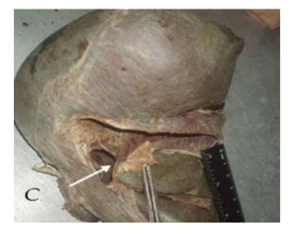
Figure 2(c): Separate ostia for middle (M), left (L) and right (R) hepatic veins. This is triple-type opening. Note the distance between the MHV and RHV (d)