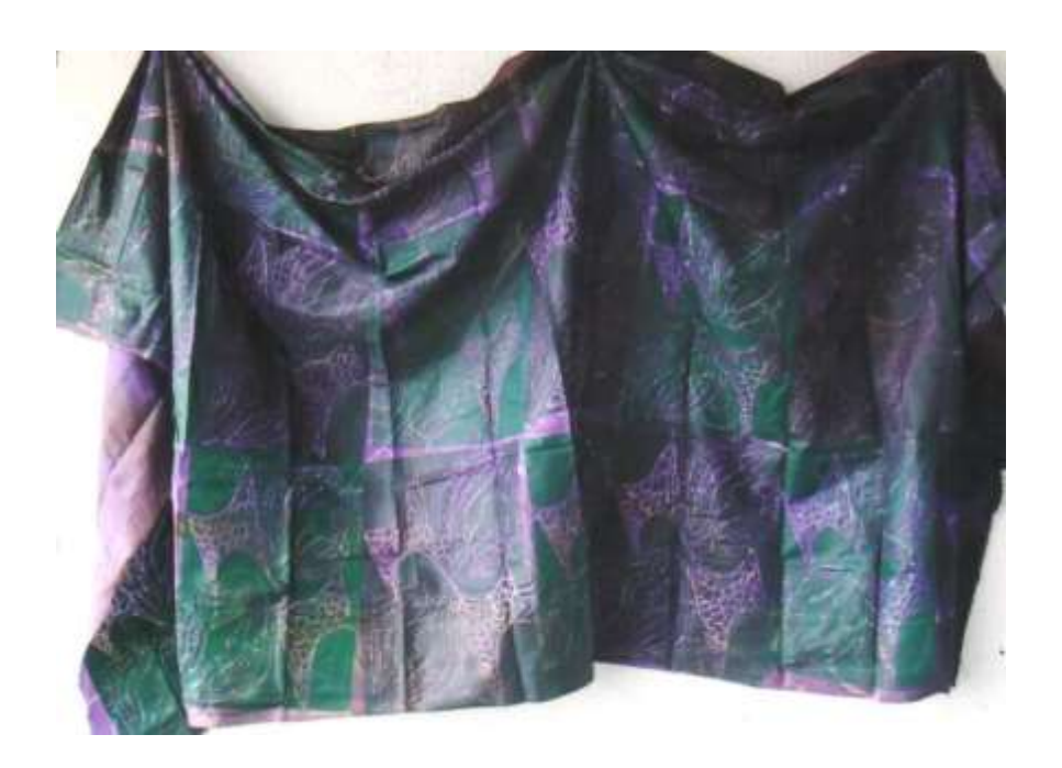
Plate 1: Isaac Ojo Fajana, Aye Dada, pen and ink on tie-dye, 144cm x 36cm, 2014, (Artist's collection), Photo Credit: Edo Patience.

Ojo creative work in (Plate 1) titled: Aye Dada (Good Future) with green and purple colours, he applied and display his idea of forms and Stylistic. The background and the pattern are treated together. The colours are in green and purple on the pattern which is also the background of the work. The green and the purple motif have some treatment of bolder dot as a textural touch within the work.