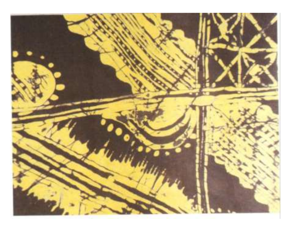
Plate 2: Adegun Olalekan, Akpoti Oloro, wax resist, 144cm x 36cm, 2014 (Artist's collection), Photo Credit: Edo Patience.

Adegun Olalekan uses the adire wax resist method and adopts the adire commemorative patterns for which he seems to have had a peculiar interest. Adegun uses brown and yellow colours that are common in day to day wears and his compositions like those of his tutor are typified by several patterns of Olokun series of the mythical designs in Ibadan Dun of the traditional symbolic designs which is in Akete design; in blade edged in (Plate 2) titled: Akpoti Oloro (seat of wealth) with brown and yellow colours, the work carries vertical and horizontal artistic form and a few of linear complicative textural work at the upper edge, and that makes the work a unique one.