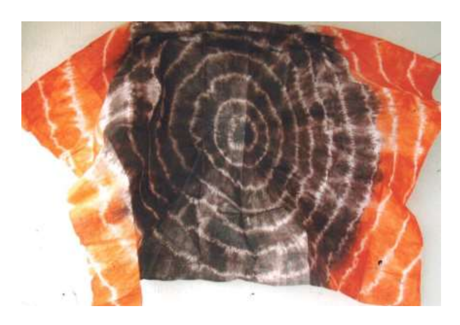
Plate 5: Datapwa Kathrine Ezekiel, Ishe Oluwa, tie-dye resist, 144cm x 36cm, 2015, (Artist's collection), Photo Credit: Edo Patience.

Another of her work that indicates stability in both style and technique is in (Plate 5) titled: Ishe Oluwa (God's work) is in brown and Yellow colour an idea from the convectional method in term of colour. The design is also derived from a series of circles which is also conspicuous, the pattern in the works is solid and original. Datapwa Kathrine displayed a technical prolific arrangement in the picking and tieing of the work with a good resemblance to those of the western fabric. This is an evident of her consistent depiction of abstractic forms and usage of her medium to arrive at her method. She admits that she adopted the abstractic form from her mentor, in the course of her informal training.