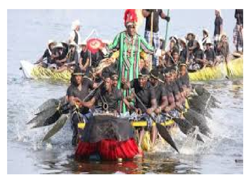
Ama Oru Traditional (Men) War Boat Regatta in Amassoma Festival 2017