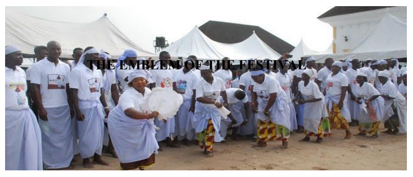
Adegbe Deity Members Worshiping the Deity at the Festival in Amassoma 2017