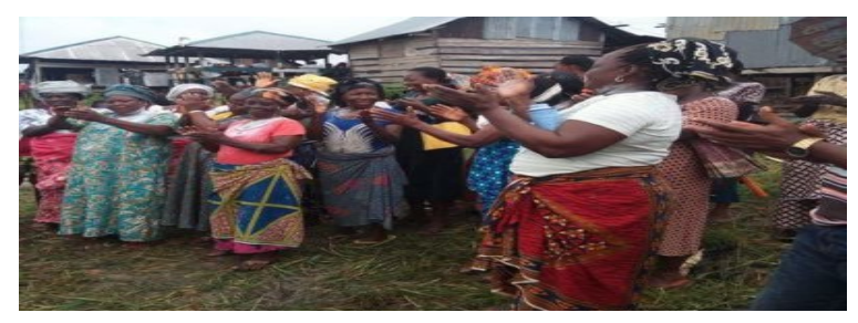
Women of Amassoma Expressing Their Delight after Seigbein Practice (Throwaway Evil) Was Conducted at the Festival in Amassoma