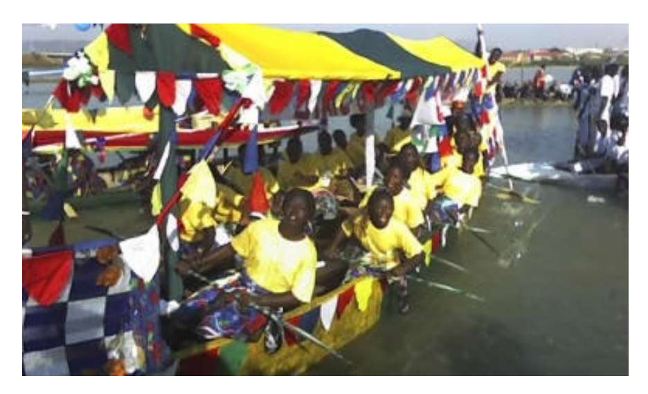
Ama Oru Traditional (Woman) War Boat Regatta at the Amassoma Festival 2017