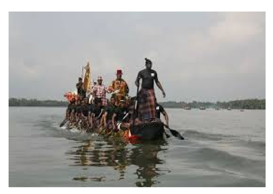
Ama Oru Traditional (Men) War Boat Regatta in Amassoma Festival 2017