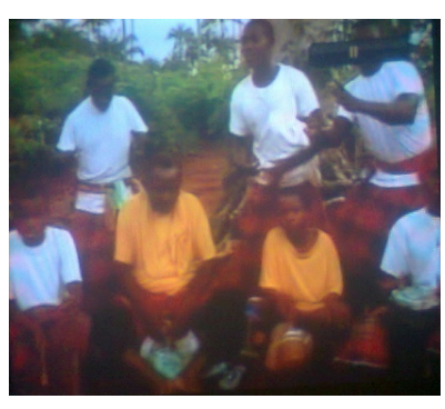
Fig. 5: Dancers Flanked by Instrumentalists Supplying Musical Accompaniment.