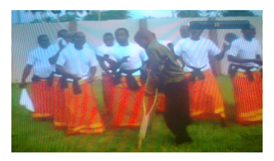
Fig. 2: A physically challenged (an amputee with clutches) carried away with the dance troupe limps towards the scene to express his emotion of ecstasy through dance

Furthermore, Uzoigwe's work creates the impression that dancing activity is not given prominence by being featured frequently in Abigbo; dancers hardly dance a cappella just like singers and instrumentalist; singing takes precedence over dance; in the order words, songs are more prevalent than dance. Because his study is not dance-specific, he therefore pays little or no attention to definition of some topical terms while referring to them to buttress his points in dance.