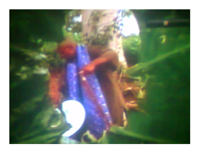
Fig. 3: Abigbo Choreographer Posing for Dance.

Throughout history, philosophers and critics' impressionistic views on choreographic art have suggested different definitions of dance that have mounted to little more than descriptions of the kind of dance with which each writer was most familiar. Thus, Aristotle in the poetics refers to dance as rhythmic movement whose purpose is to present men's character as well as what they do and suffer. Two Nigerians –Emeka and Okafor (2004:85a) define dance as the by-product of invented or choreographed movement, and "the patterning of the human body in time and space in order to give expression to ideas and emotions. People's daily movement habits usually reflect in their dance." Encyclopedia Britainica (1988:97) defines dance as "The art of expressing sentiments of the mind or its passions, by measured steps or bounds that one made in cadence by regulated motions of the body."