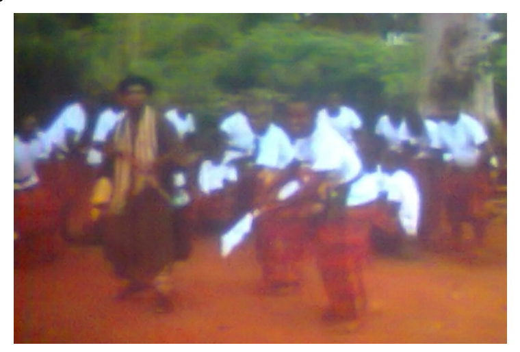
Fig. 4 Two dance trainees taking instruction from the choreographer with the ensemble watching under the gmelina tree

At the initial stage of dance rehearsals, every member participates in learning both the dancing and drumming. As time goes on, those gifted in instrumental performance are chosen. For convenience sake, the dance troupe's meeting and rehearsals are carried out in an isolated make-shift enclosure, made of palm fronds. While learning the dance, as soon as the learning process is accomplished, before the public witness it, the said enclosure is dilapidated for no other obvious reasons than superstitious belief.