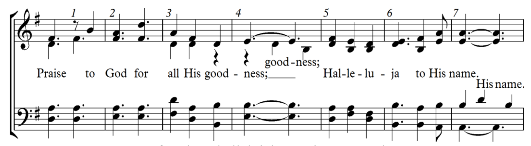
Fig. 2: Opening bars of "Glory hallelujah to His name" showing a strict pentatonic harmony

The creative proliferation of these indigenous music idioms, styles, and concepts can be found in choral and solo works by Ayo Bankole, Akin Euba, Dan Agu (1998), Idolor (2008), Nwamara (2007), Onyeji (2008a), Ofuani (2016), Dan Agu's works in Adedeji & Nwamara (2017), and many others. The proliferated indigenous elements sonically and melo-rhythmically imbue the music as Nigerian, even though they are intercultural in content. Sam Ojukwu's choral works also fit as an example of an intercultural approach, but in essence, his compositions still reflect some level of indigenous orientation in performance.