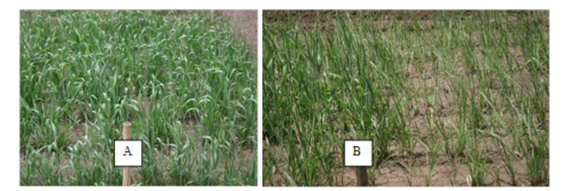
Figure 1. Fenitrothion 50 EC sprayed (A) and untreated plots (B), 2013 (Note leaf rolling and colour on B).