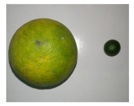
Figure 1. Disparity in mature fruit sizes of two citrus accessions from the field genebank of the CSIR - PGRRI, Bunso, Eastern region, Ghana.