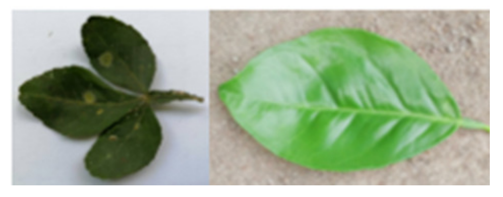
Figure 2. Trifoliate leaf (left) of flying dragon and simple leaf (right).

The data collected were used to generate a dendrogram as shown in Figure 3.