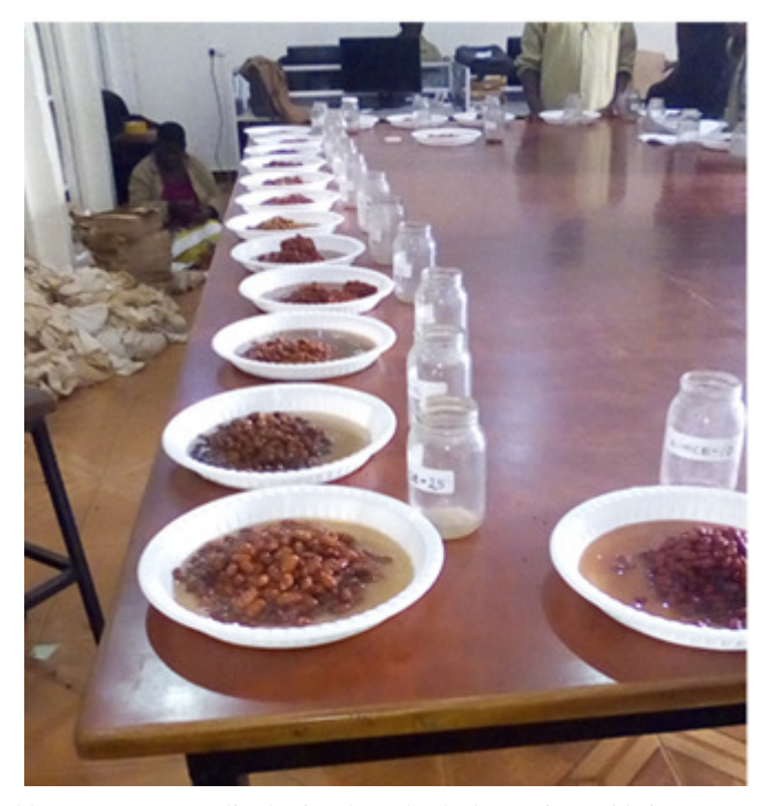
Figure 1. Canned bean genotypes displaying how both the grain and brine were properly visible to the evaluation panel.

on a scale of 1 to 5 rating; where 1 = poor and 5 = excellent, based on a modified Michigan State University (MSU) bean canning protocol (Uebersax and Hosfield, 1985).