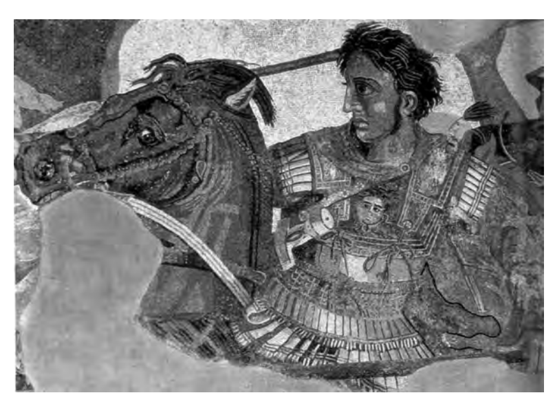
Figure 4: A mosaic from Pompeii depicting Alexander the Great charging on his horse, Bucephalus, in the battle against Darius III at Issus, 333 BC. Naples Museum.

In order to assess the role of combat stress in the specific incident of 326 BC, it is necessary to outline the events leading up to it.