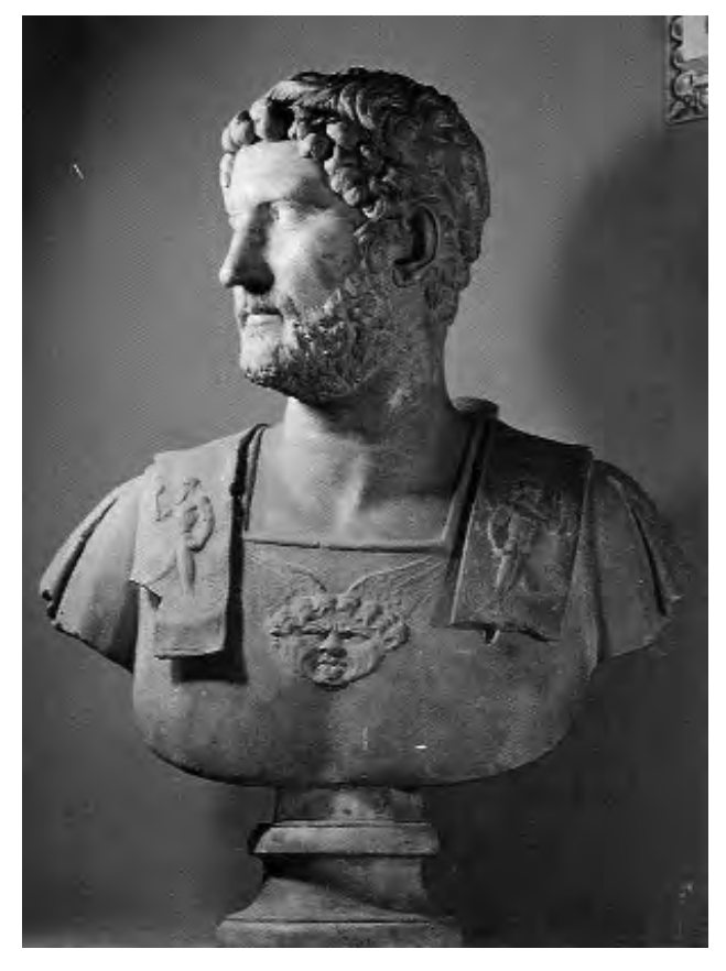
Figure 16: Bust of Hadrian (117-138): died of chronic heart failure. Capitoline Museum, Rome.