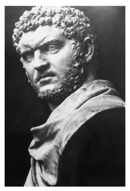
Figure 19: Bust of Septimius Severus (193-211): died of complications related to chronic gout.

Claudius II died in 270, during a campaign in the northern provinces, of what was commonly identified as the plague. Genuine bubonic plague, however, did not make an appearance as an epidemic disease until the 6<sup>th</sup> century, in the Epidemic of Justinian.<sup>11</sup> It is more likely that Claudius died as a result of the Epidemic of Cyprian which ravaged the Roman Empire in 251-266 and then spread to the rest of Europe. We have suggested elsewhere that this was smallpox, but it may well in fact have been influenza.<sup>12</sup>