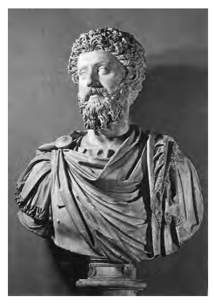
Figure 14: Bust of Marcus Aurelius (161-180): died of fever and abdominal disorders, possibly smallpox. Capitoline Museum, Rome.

Augustus (AD 14) (Fig. 15) and Vespasian (AD 79) died of diarrhoea and fever, symptoms reminiscent of typhoid, dysentery or even communicable food-poisoning. Antoninus Pius (AD 161) met his end with vomiting and fever after a dinner of Alpine cheese, which was given as the cause of death; this may well also have been food-poisoning.