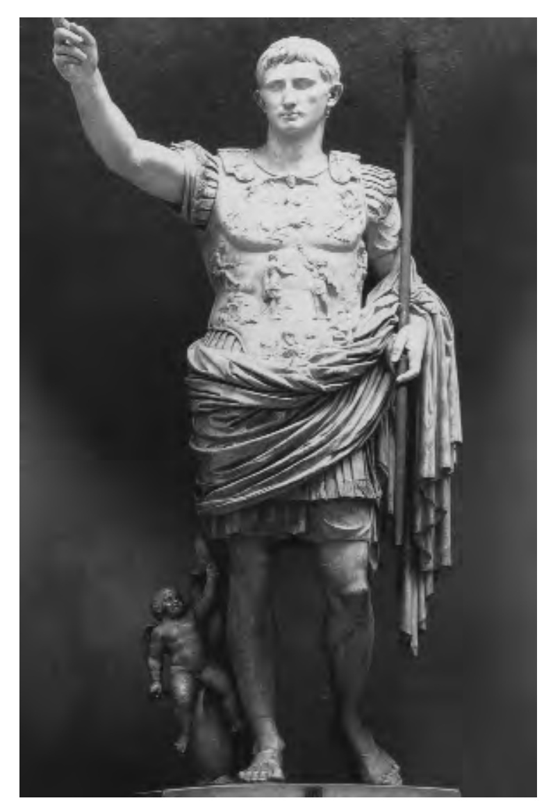
Figure 15: Augustus (27 BC-AD 14): died of fever and diarrhoea. Vatican Museum, Rome.