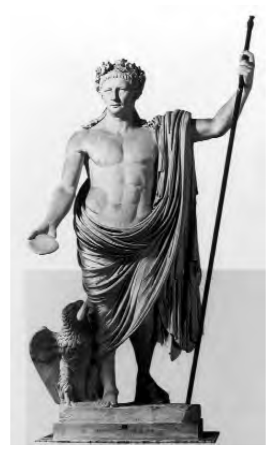
Figure 17: Statue of Claudius (41-54) as the god Jupiter: poisoned with mushrooms. Vatican Museum, Rome.

Six emperors were murdered. It is generally accepted that Claudius (Fig. 17), who probably suffered from cerebral palsy, but without any diminution of his mental faculties, was poisoned by his wife Agrippina (54).