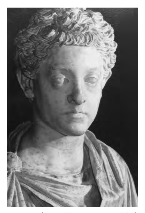
Figure 18: Bust of Commodus (180-193): strangled after an unsuccessful attempt at poisoning. Capitoline Museum, Rome.

Commodus (Fig. 18) was throttled by a guard (193) after his concubine Marcia's failed attempt to poison him.