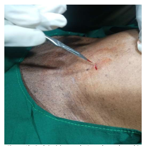
Figure 1b: Stab incision made 4cm above the pubic symphysis

Figure 1a: Materials Needed: Scapel on Bard-Parker handle, catheter introducer, 3 way foley's catheter, 10ml syringe, xylocaine injection