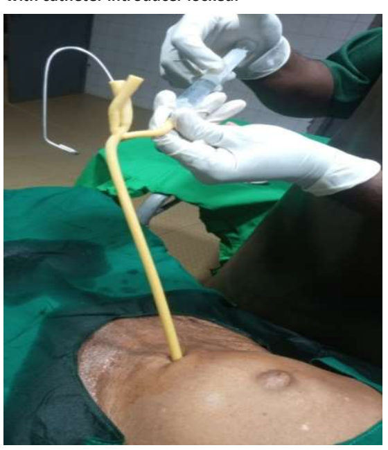
Figure 2b: Unlocked catheter introducer with catheter balloon being inflated.