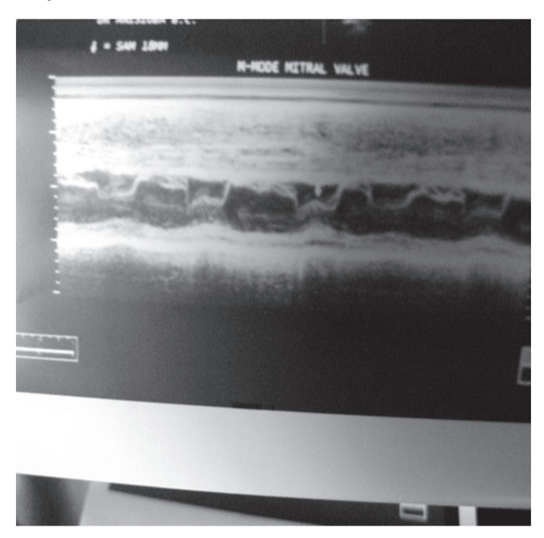
FIG 2. M-mode echocardiography of the patient across the mitral valve showing Systolic Anterior Motion (SAM) of the anterior mitral valve leaflet. Arrows shows the leaflet making contact.