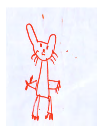
Fig. 1c: The Drawing of a Cat (Age 4)