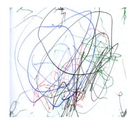
Fig. 1a: The Scribbling of a Pre-School Child. (Age 2)