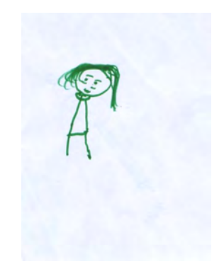
Fig. 1b: The Impression of a Girl. (Age 3)