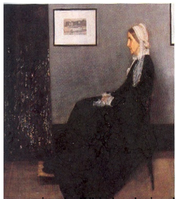
Fig 3: James Abboth Mcneil Whistler: Arrangement in Black and Grey (Portrait of the artist mother) 1871. Oil on canvas, 1.45x1.64m. Musee d' Orsay, Paris.

In other words, unconsciously whistler depicted his childhood relationship with his mother. It is possible that he speaks about conception where colours, geometry and humanistic traits are significantly depicted.