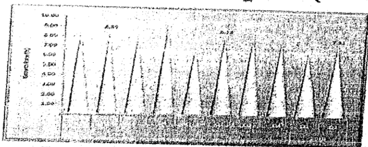
Fig. 3: Manufacturing Growth Rate % (Q1-Q4, 2009 and Q1 2010)