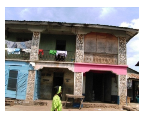
Plate 6: Afro-Brazilian designs, Ilesa (2007) Plate 7: Afro-Brazilian design, Ilesa (2007)