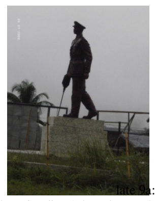
Plate 9b: Brigadier Ademulegun, Ondo