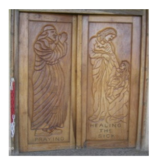
Plate 10: Carved door, Anglican Church Idiaagba-Titun Akure (2007)