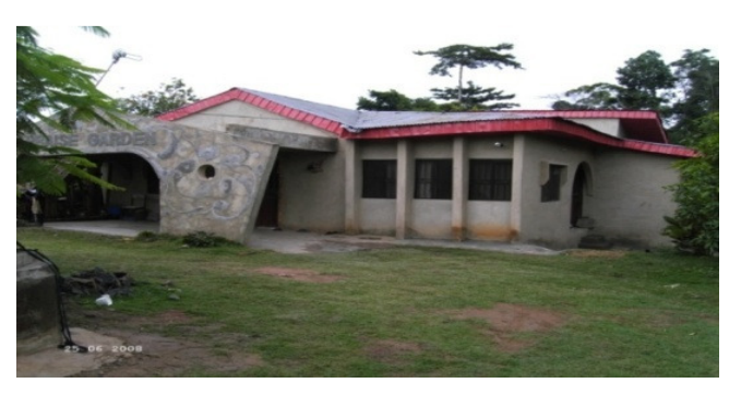
Plate 8: A house with moulded decorations, Akure (2008)