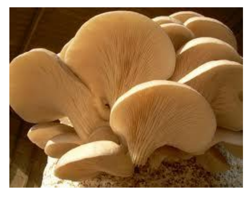
Plate 3: Basidiocarp developed from strain 5 of P. osreatus x L. edodes cross.