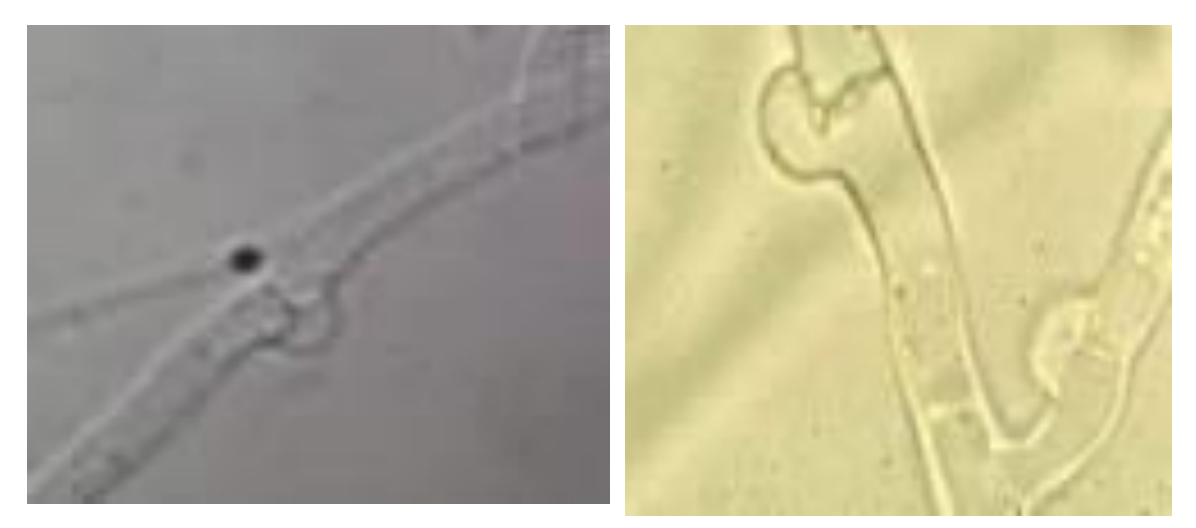
Plate 2: Clamp connection between P. osreatus and L. edodes at one point (left) and two points (right) under 100 x magnifications.