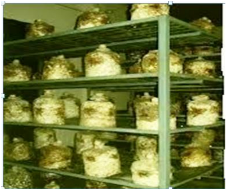
Plate 1: Development and fruiting of mushrooms in polyethylene bags inside growth room at room temperature.