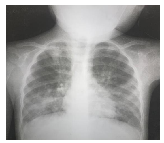
Figure 3: Chest X-ray showing bilateral opacities

consolidation with peripheral bilateral inflammatory consolidations. There was also diffused areas of cystic bronchiectasis bilaterally with right hilar lymph nodes enlargement suggestive of TB (Figure 4). Sputum AFB and Gene Xpert were negative for Mycobacterium tuberculosis . He was commenced on anti-TB drugs and is presently being followed up at the clinic with significant improvement.