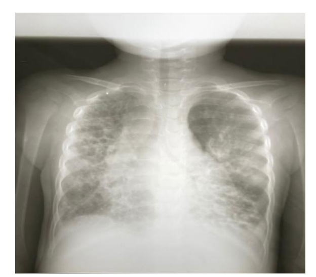
Figure 1: Chest radiograph of Case 1 with bilateral honeycombing of the lung parenchyma

In the cardiovascular system, she had anterior bulging of the cardiac area, displaced apex beat to the fifth intercostal space anterior axillary line, a grade 3 pansystolic murmur loudest at the left lower sternal border. A chest radiograph revealed hyperinflated lung fields with bilateral bronchiectactic changes that were more prominent on the right. (Figure 2) Chest CT confirmed deformity of the thoracic skeleton (pectus carinatum). Additional reports from the chest CT included an increased volume of the right lung and a decrease on the left with hyperaeration. There is a honeycombing image in the left lung, keeping with bronchiectasis. There is consolidation with an air bronchogram in the posterior inferior segment of the inferior lobe of the right lung. Also, there is an interstitial pattern (diffuse ground glass opacity in the middle and inferior lobe of the right lung - inflammatory interstitial oedema). The heart was enlarged but there was no lymphadenopathy. Normal soft tissue outlines were also reported. Left lung bronchiectasis with right lung pneumonia and diffuse inflammatory interstitial oedema was diagnosed. Echocardiography revealed a large ventricular septal defect (VSD). Gastric lavage for GeneXpert and AFB and retroviral screening were all negative. She was managed with