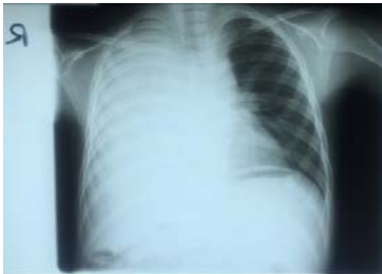
Figure 1. Chest radiograph showing a homogeneous opacity in the right lung

tenderness. Air entry was reduced on the same side, with a dull percussion note, increased vocal resonance and bronchial breathing; the left side was normal. Other systems were normal. A provisional diagnosis of lobar pneumonia was made and he was started on IV antibiotics with ceftriaxone 2 g once daily for one week. Investigations done included a complete blood count (CBC), which showed leukocytosis (WBC 12.3 \times 10^3/\mu\text{L} ) with predominant neutrophils and mild anaemia (Hb 10.7 g/dl). Renal function tests (RFTs), liver function tests (LFTs), urine and stool analysis were normal. GeneXpert MTB/RIF, Mantoux test, HIV antibody test and DNA-PCR were negative, CD4+ T cell count 1,199 cells/L. Serum beta hCG, alpha-fetoprotein and LDH were normal. The chest X ray (CXR) showed a large homogenous opacity on the right side (Figure 1).