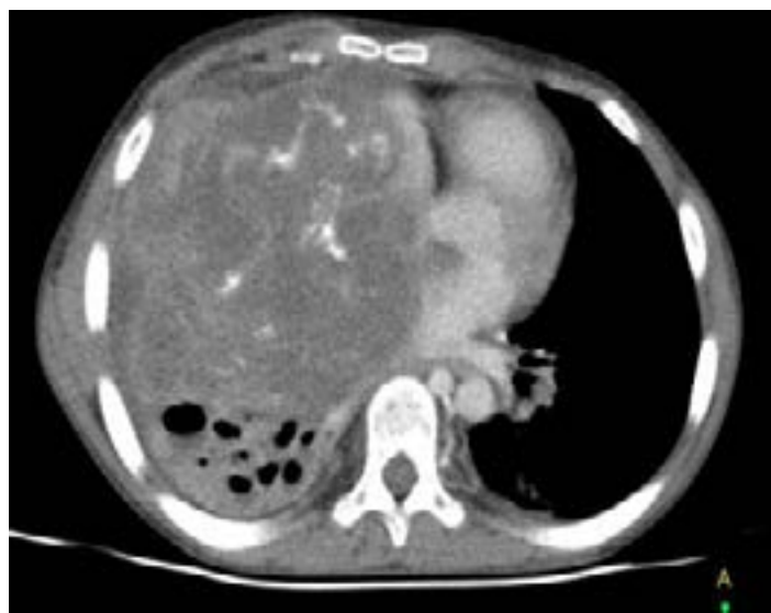
Figure 3. Contrasted axial chest CT image showing an extensive hetero-complex mass in the right hemi-thorax with pericardial invasion

sis showed raised protein 1.179g/dl, low glucose 0.1 mmol/L, total WBC 5 cells/uL, and no organisms on Gram stain. However, India ink staining, CSF CrAg and culture were not done. Given these findings, he was initiated on IV amphotericin B 0.7 mg/kg once daily for 14 days for PC. The cardiothoracic surgeons recommended surgery, however, the child's caretaker declined opting for medical treatment first. He improved and was discharged on oral fluconazole 200 mg once daily. The child did not attend follow-up appointments and was lost to follow-up.