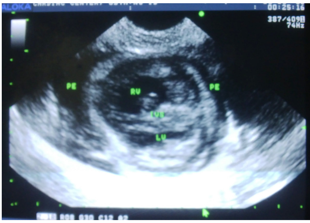
840x572mm (72 x 72 DPI)

Figure I. Short axis parasternal view of a 10 year old boy showing pericardial effusion around the right ventricle. Indicated as PE on the image