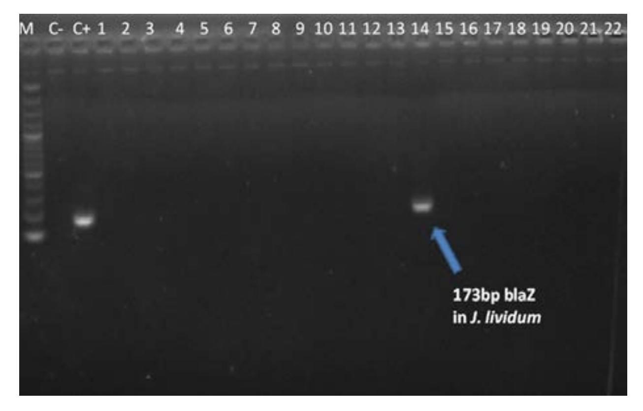
Figure 2: Amplification of 173bp blaZ resistance gene in J. lividum (M: 100bp marker)