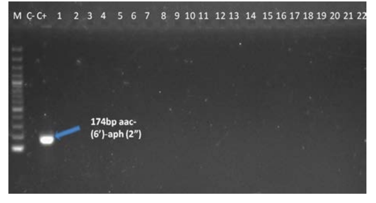
Figure 3: Amplification of aac-(6')-aph-(2') resistance gene in J. lividum (M: 100bp marker)