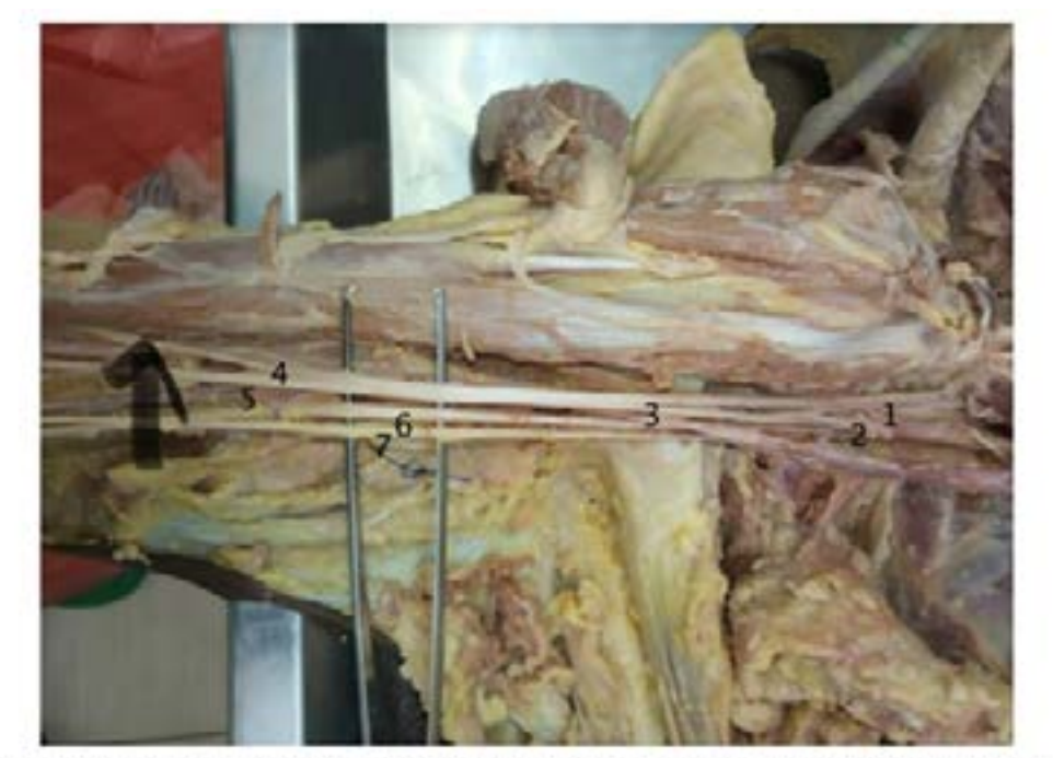
Figure 2: 20 year old female Rwandan cadaver right axilla dissection photograp photography. 1: lateral cord, 2: medial cord, 3: median-musculo-cutaneous ner cutaneous nerve, 5: median nerve, 6: ulnar nerve, 7: medial cutaneous nerve of