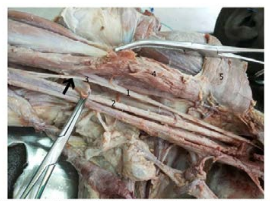
Figure 1: 40 year old male Rwandan cadaver right axilla dissection photography ( 1: musculo-cutaneous nerve, 2: median nerve, 3: branching anastomosis from m to median nerve, 4: coracobrachialis muscle, 5: Pectoralis major muscle

median nerve. This communicating branch was slightly smaller than the musculocutaneous nerve, as illustrated in Figure 1. On further course, the nerve fibers of this anastomotic branch mixed with fibers of the median nerve. However, a distinct bundle of this branch could be seen medially as far as 2 cm above the cubital fossa. From that level it was completely mixed with the fibers of the median nerve .