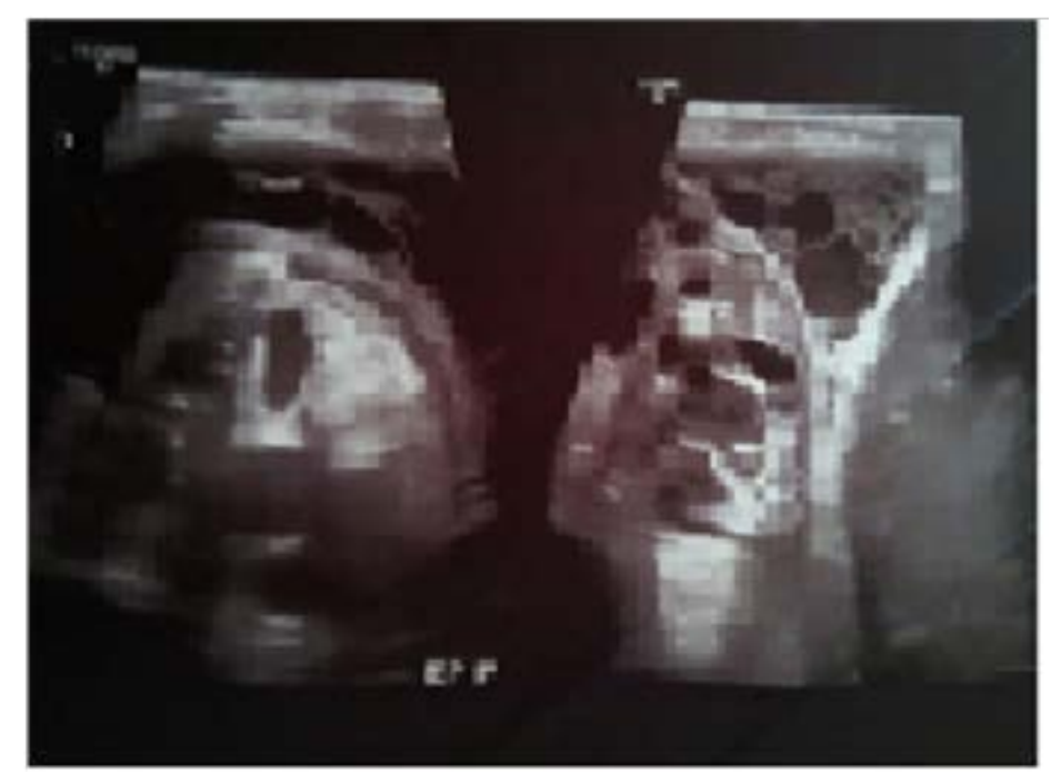
Figure 2: Chest ultrasonography showing multiple cysts occupying almost all of the left hemithorax associated with pleurisy