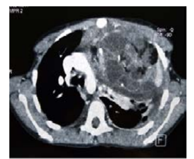
Figure 3: Chest CT showing heterogenous left-sided mass with many areas of calcifications

We considered an atypical intrapulmonary tumor or malformation. A contrast-enhanced computed tomography (CT) was performed, objectifying a heterogeneous mediastinal antero-left mass, well limited measuring more than 15 cm, many small areas of calcification and cavitation in the lower lobe of left lung associated with homolateral pleural effusion (Figure 3). Chest X-ray and CT scan findings were consistent with the diagnosis of calcified teratoma ruptured in the mediastinal pleura.