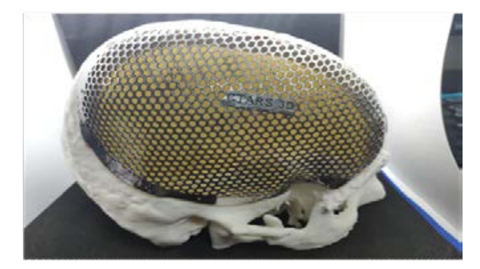
Figure 9: SLM Printed Ti implant