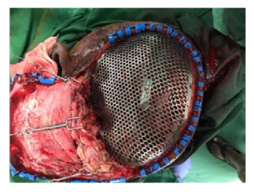
Figure 10: Ti graft implantation

tance. Between 6 months to 1 year postoperatively, his incisions healed completely, and CT scan showed no recurrence of subdural abscess. He demonstrated significant progress with regard to speech, independent ambulation, and ability to engage in activities of daily living. Despite residual difficulty with word recall and short-term memory at 1 year follow up, the patient was very satisfied with his functional status and physical appearance.