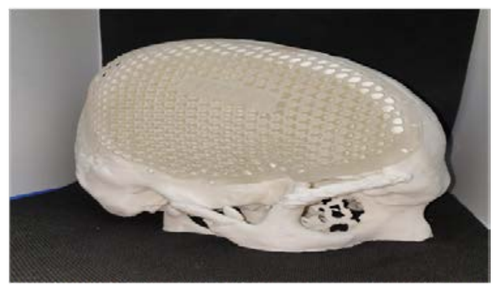
Figure 7: Printed trial implant mesh

Once the trial phase is over, the cranioplasty implant grafts was made of titanium grade -5 medical grade, modelled by CAD/CAM technology and produced by Selective laser melting (SLM) technology. SLM is in an additive manufacturing method specially developed for 3D Printing metal alloys. The full melting process allows the metal to form a homogeneous block with good resistance<sup>10</sup>. It creates parts additively by fusing titanium metal powder particles together in a full melting process . This novel technique provides the precise shape of the titanium implant in a virtual 3D model of the patient's skull . With the SLM technique, the previously designed titanium graft was printed in SLM R 125 machine (by SLM Solutions Gmbh ,Germany) . The specification of SLM 125machine are 125mmx125mmx125mm (LxBxH) build envelope. 3D optics single IPG fibre laser configu-