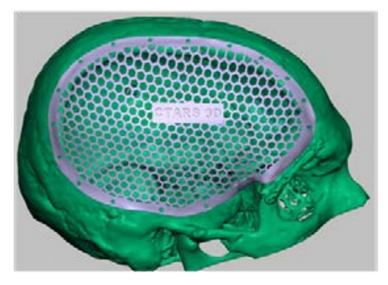
Figure 6: CAD- Resin mesh