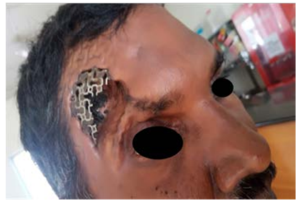
Figure 1: Exposed Titanium Mesh

had appearance of scalp ulcerations. So the Ti mesh was surgically removed. As the scalp thickness was very thin the defect area started to sink in and thus intra cranial pressure shooted up. Patient slowly had detoriation in the movement of left hand. Interdisplinary approach of neuro surgeons and prosthodontist a custom made cranial Ti implant was planned.