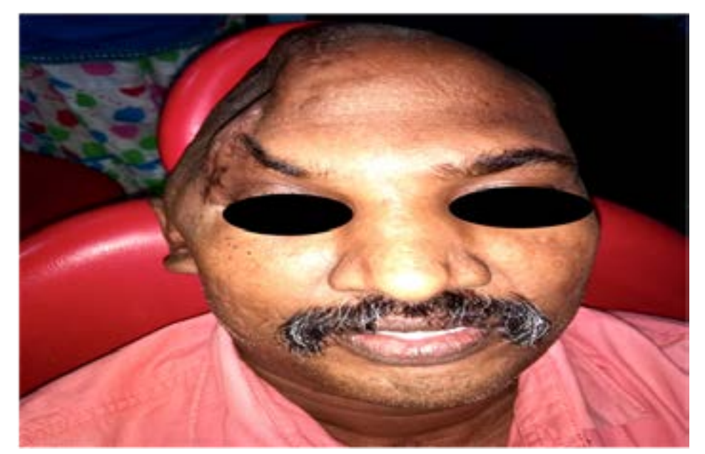
Figure 2: Right Cranial Defect

was taken and CT Scanning was adviced. We didn't attempt to take impression of the defect as the skin overlying was very thin.