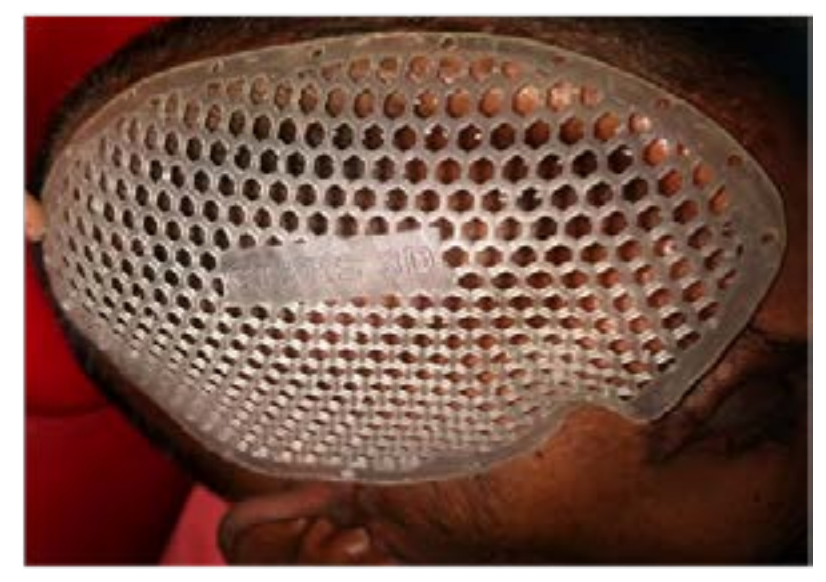
Figure 8: Resin mesh Try in