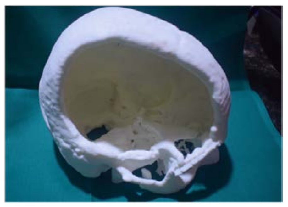
Figure 5: FDM 3D Printed cranial model

The resin trial implant mesh was inspected thoroughly for the extension, thickness and the diameter of the screw holes. The trial implant was rechecked with the patient's defective area (fig 7).