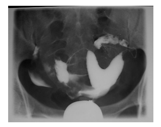
Fig 5: Unicornuate unicolis uterus complicated by hydrosalpinx

Fig 4: Urcuate uterus and bilateral loculated peritoneal spill, a sign of pelvic peritoneal adhesions