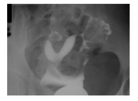
Fig 4: Urcuate uterus and bilateral loculated peritoneal spill, a sign of pelvic peritoneal adhesions

Figure 3: Congenital abnormality. Bicornuate uterus with both fallopian tubes opacified giving peritoneal spill