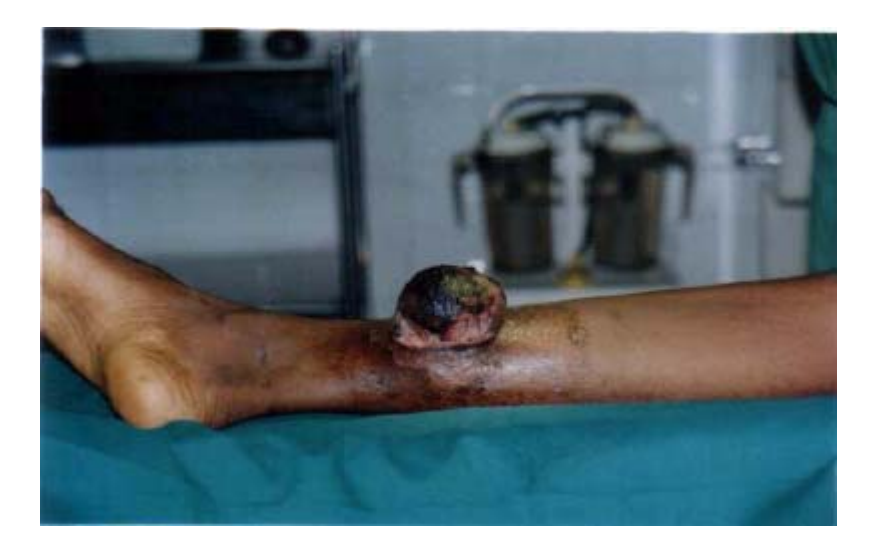
Figure A: Preoperative appearance of Fungating extremity tumour

The wound healed primarily but a month postoperatively, a painful tender swelling developed in the scar and discharged pus from which pseudomonas specie was isolated. The swelling resolved with oral ciprofloxacin. He was referred for radiotherapy but did not commence this until about 9 months later. He was reported to have died suddenly of pulmonary complications while undergoing radiotherapy. Autopsy was reportedly not performed.