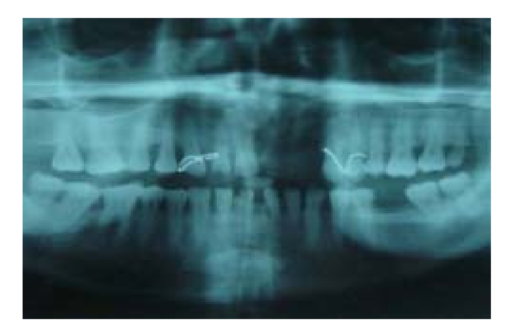
Figure 2B the paternal print-II, 4 showing lateral conical incisors, with marked dysplastic enamel.

Figure 2 A: X ray pantograms the maternal-print- II, 3, showing marked hypodontia, and severe dysplasia of the lateral incisors