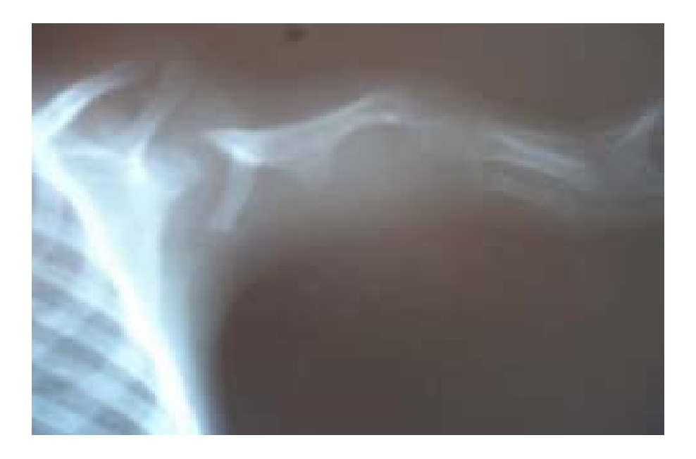
Figure 1C: Spinal X ray of the proband showing marked juvenile scoliosis secondary to congenital limb deficiency.

Figure 1 B: X-ray of the upper limb of the proband: note the severe abbreviation of the humerus, which is attached to an ectopic bone, clavicular duplication, markedly dysplastic supernumerary radial bones with rudimentary ulna and severe dysplasia of the fingers.