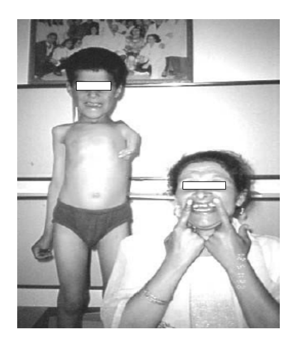
Figure 1A : the proband ( III, 2 ) with congenital left upper limb deficiency, hypodontia, is next to his mother ( II, 3 ). N ote the sparse skull hair, the lack of eye brows and eyelashes, marked hypodontia and persistence of the deciduous teeth (see her pantogram figure 2-A).

Shadowed squares and circles are variably affected family subject with Hypohidrtotis ectodermal dysplasia, the small black dots (generation) are multiple spontaneous abortions, whereas blackened III, I is juvenile death.