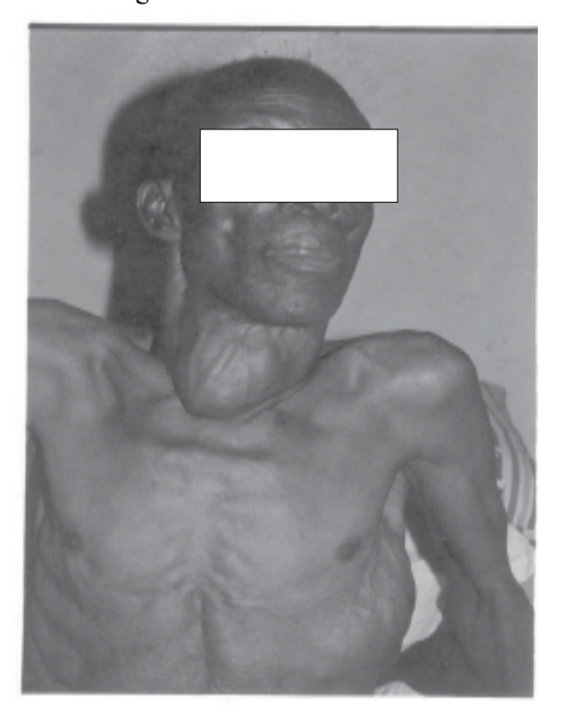
Figure 1: Showing the anterior neck swelling and the swelling on the lateral left chest wall.

A provisional diagnosis of severe respiratory distress secondary to advanced thryroid carcinoma with possible chest wall metastasis was made.