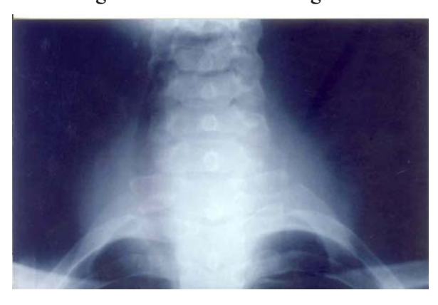
Figure 2: Showing the goitre with severe trachea narrowing and deviation to the right

(Fig 2). The thyroid function test results were T3 1.4 nmol/L (1.0-3.25), T4 36 nmol/L (65-175) and TSH 2.6 mU/L (0.5-6.5). Pre-operative assessment of the vocal cords was not possible because of the worsening respiratory distress. The anaesthetic assessment was a poor anaesthetic risk patient for general endotracheal anaesthesia with ASA IIIE, Mallanpati IV, SRC III, especially in view of X-ray features of tracheal stricture. He had 3 pints of blood urgently grouped and crossmatched for him and was rushed to theatre.