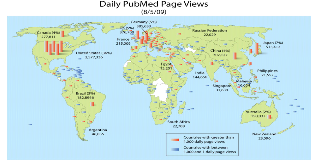
Figure 1: Daily PubMed Page Views, 5 August 2009

This growing desire for more bandwidth is taking place against a backdrop of limited Internet access and reliable electricity. Africa has 15% of the world's population with only 5% of the world's Internet users (table 2). Lack of internet access is compounded by inadequate and unreliable electricity supply. Seventy-