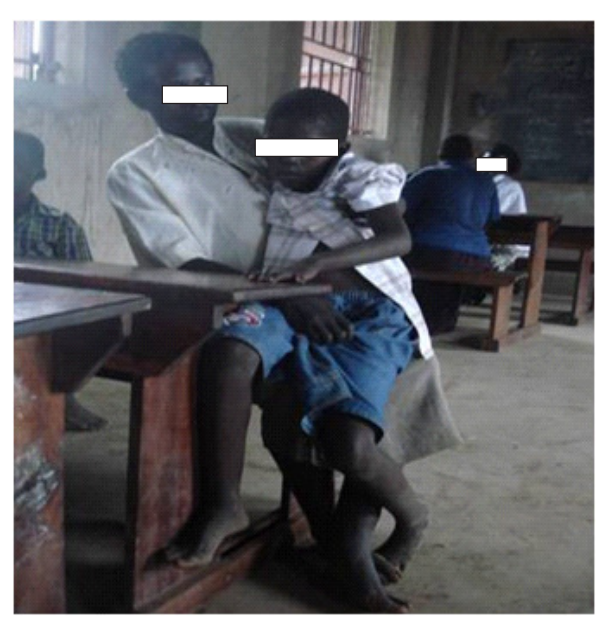
Final diagnosis: Complex PTSD in childhood with depression

The treatment which was tried in the IDP camp Albendazol, Carbamazepine, Phenobarbitone, Antibiotics and Traditional healing but all with no improvement. At Mulago hospital, after psychiatric assessment, he was treated with Imipramine 50mg nightly, Family supportive therapy (counseling with mother) and encouraged play therapy as well as supervised feeding. After 4 weeks on the above treatment, his mood became brighter, he smiled, volunteered conversation, ate 2 full meals daily, slept well and the fear, stares and head stooping (nodding) all stopped. He was able to walk when supported though still tremulous on account of severe muscle wasting but he gained weight. He was then discharged as improved with advice to continue on the treatment.