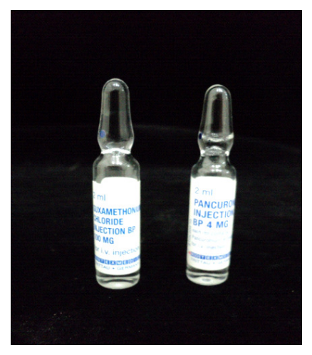
Figure 1: Similar looking ampoules of suxamethonium and pancuronium

the drug ampoule. It was then discovered that pancuronium 4mg ampoule had been mistaken for a suxamethonium 100mg ampoule! IPPV was maintained throughout the surgery. At the end of surgery, residual paralysis was reversed with neostigmine and atropine and the patient was extubated. He recovered fully with no adverse sequelae (see figure 1).