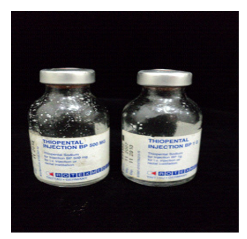
Figure 2: Thiopentone 500mg and 1gm vials

A 2-year old child with Retinoblastoma was booked for enucleation. At induction of anaesthesia 100mg of thiopentone sodium was administered in place of 25mg of the same drug! Suxamethonium chloride 12.5mg I.V was given and the child was intubated with a size 2.5mm ETT. It was observed that the ventilation had to be assisted for over 10 minutes before spontaneous respiration was resumed. We were wondering whether there was a prolongation in the effect of suxamethonium. All the drugs drawn were crosschecked only to discover that the anaesthetist had mixed 1gm of thiopentone with 10ml and thereafter had withdrawn 1ml (100mg) and injected instead of the 25mg that was supposed to be administered. (See figure 2) IPPV was continued and monitoring, there were no untoward sequelae in both cases.