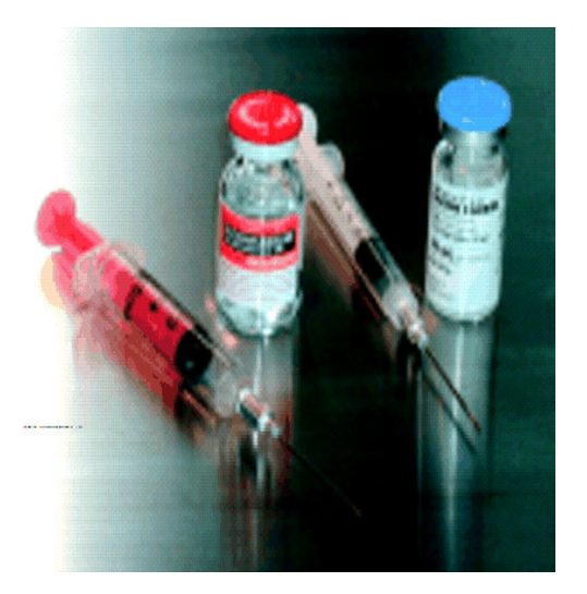
Figure 3: Colour coded vials and syringes

They also added some requirements in the lettering design and on the quality of the label adhesive. They made some recommendations on muscle relaxants: colour identified by a strong red. Simply identifying the relaxant syringes could avoid about 70–80% of the syringe swap incidents. To lock in the relationship with red and relaxants, it was decided to try to get a red syringe produced. This, it was hoped, might reduce labeling errors and give a clear indication of the relaxant syringe from all angles (see figure 3).