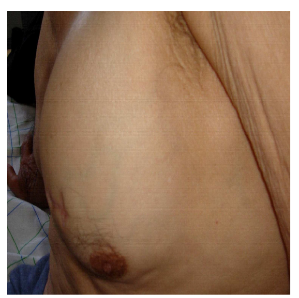
Figure 1: Chest wall tumor 722×540mm (72×72DPI)

Multiple myeloma is a malignant tumor of plasmacytes most commonly seen in the bone marrow. The thorax can be invaded by myeloma, producing thoracic skeletal abnormalities, plasmacytoma, pulmonary infiltrates, and pleural effusion<sup>1</sup>. Recognition of the atypical plasma cells in fluids is critical for therapeutic and prognostic considerations as this finding portends a poor prognosis<sup>2</sup>. These patients are usually resistant to treatment in spite of aggressive chemo-radiotherapy.