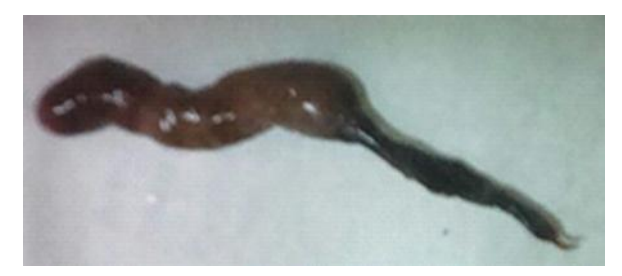
Fig. 2: The necrotic tissue after extraction

The child was catheterized, and 250mls of clear urine was drained. Laboratory investigations revealed a packed cell volume of 20% and microscopic hematuria. His renal function tests were normal. He had an abdominal ultrasound scan which showed bilateral solid renal masses with a dilated right pelvi-