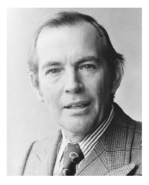
Christiaan Neethling Barnard

mous surgeons. He died in 2001 while on vacation in Cyprus, following an asthma attack.