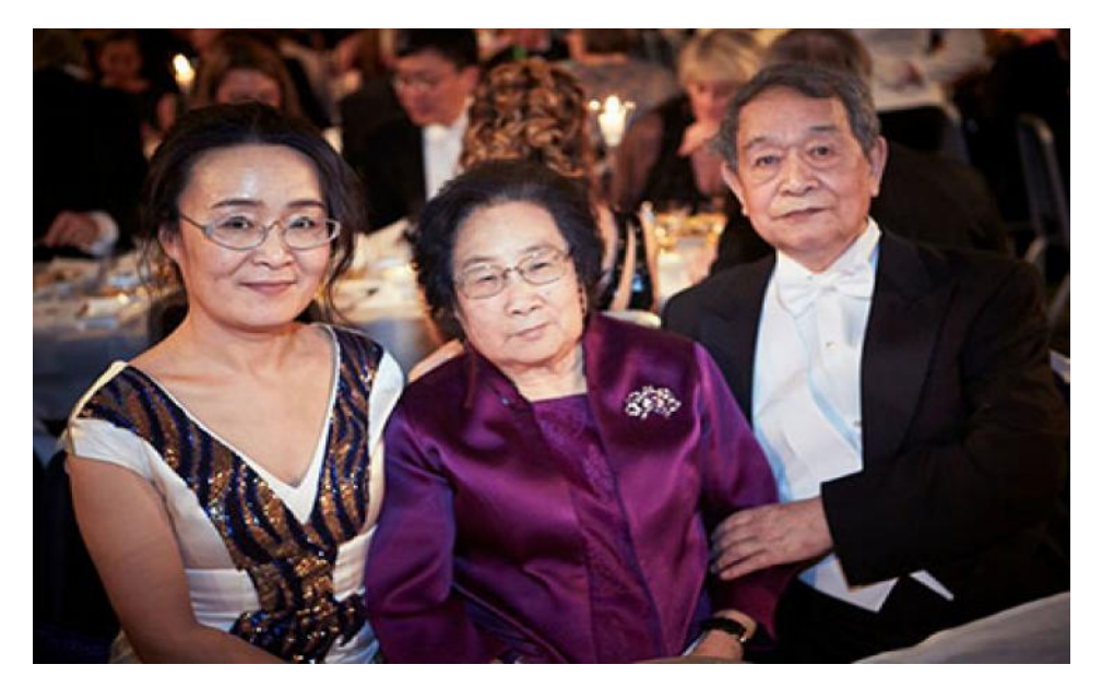
Fig 2: Youyou Tu and husband at the Nobel Awards ceremony 2015

parasitaemia with qinghaosu (68 \cdot 2 \pm 21 \cdot 4 \text{ h vs} 103 \cdot 1 \pm 18 \cdot 0 \text{ h}) and a greater inhibition of in-vivo trophozoite development. An advantage of mefloquine is the effectiveness of a single oral dose, whereas the advantages of qinghaosu are the speed of onset of action and inhibitory effect on parasite maturation".<sup>4</sup> In 1984, Li and colleagues reported a randomized trial of 80 participants given different combinations of antimalarials and where they found that mefloquine plus fansidar produced a radical cure with slight side-effects but the addition of qinghaosu greatly increased the rate of parasite clearance with no additional side-effects.<sup>5</sup>