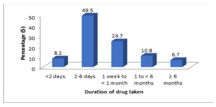
Figure 2: Duration of drugs intake for self-medication (n=194)

Figure 3 showed that the majority (159/194 or 82.0%) of the study participants used orthodox drugs for self-medication. Amongst those on orthodox drugs, 84 (84/159 or 52.8%) were on single type of drug, 52 (52/159 or 32.7%) on two types of drugs and 23 (23/159 or 14.5%) on combination of more than two types of drugs.