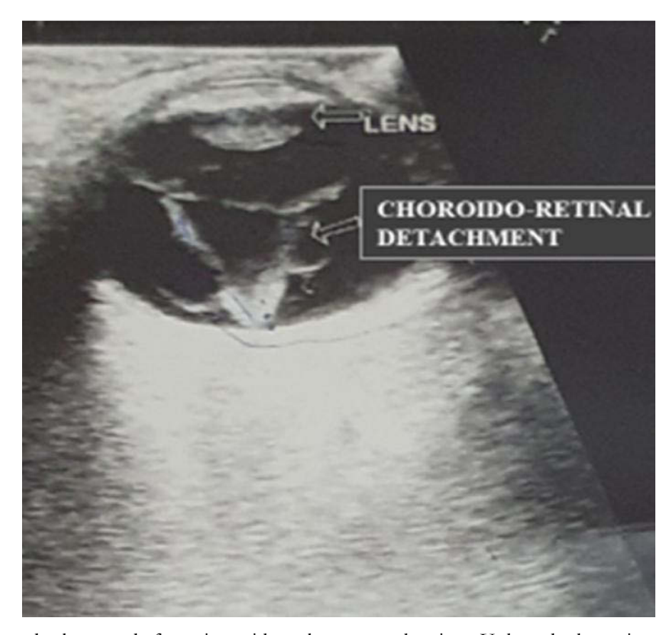
Figure 2: B-mode ultrasound of a patient with ocular trauma, showing a V-shaped echogenic structure attached to the optic nerve head and laterally to the ora serrata. Another echogenic structure is seen anterior to and attached centrally to aforementioned at the lateral and medial aspect of the eye in keeping with right eye traumatic retinal and choroidal detachment. Right eye cataract is also present.

**Number of ultrasound findings > 125 due to presence of multiple pathologies in the Same patient. Others: Choroidal detachment, Persistent Hyperplastic vitreous, Anterior chamber hyphaema, Drusen, Anterior chamber collapse, foreign body in posterior chamber, Phthisis bulbi, orbital cellulitis, Thickened corneal, Eyelid oedema, buphthamos, micro ophthalmia, uveitis and lacrimal gland calculus.