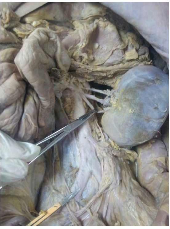
Fig 4 : Three renal arteries were detected on the left side. Two arose from the lateral surface and one from the anterolateral surface of the aorta. All of them have entered the kidney through the hilum