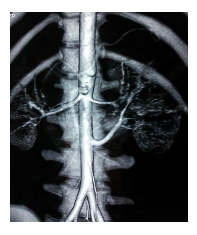
Fig 6: SRA on the left side arising from the aorta.