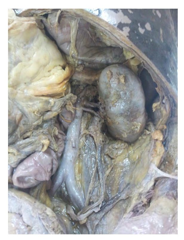
Fig.1 : A supernumerary renal artery on the left side arising from the abdominal aorta.