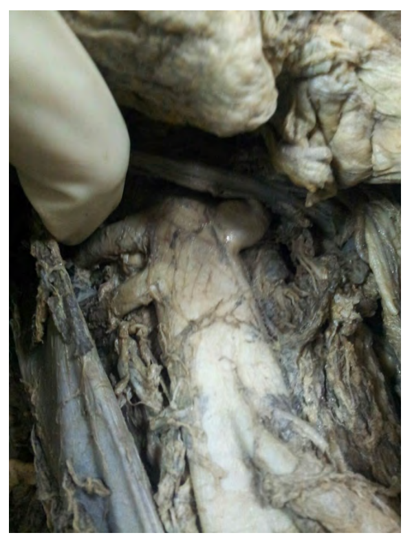
Fig 2 : A supernumerary renal artery on the right side arising from the abdominal aorta.