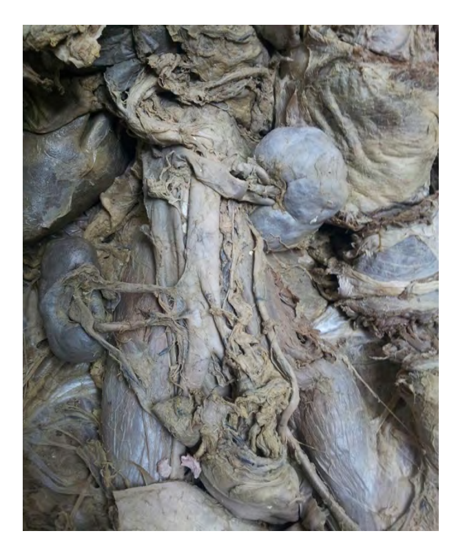
Fig 5 : One cadaver with low lying kidney on the right side with two renal arteries arising from the aorta at the level of L3.