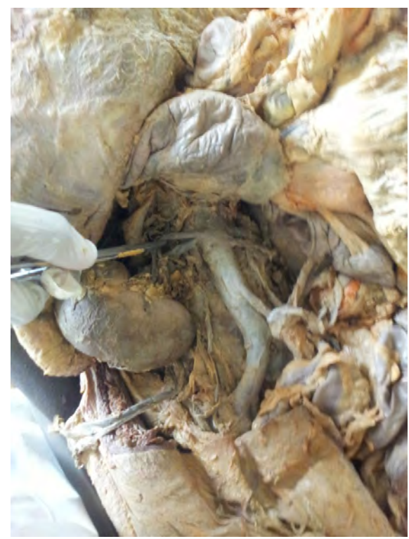
Fig 3: Bilateral SRA arising from the abdominal aorta.