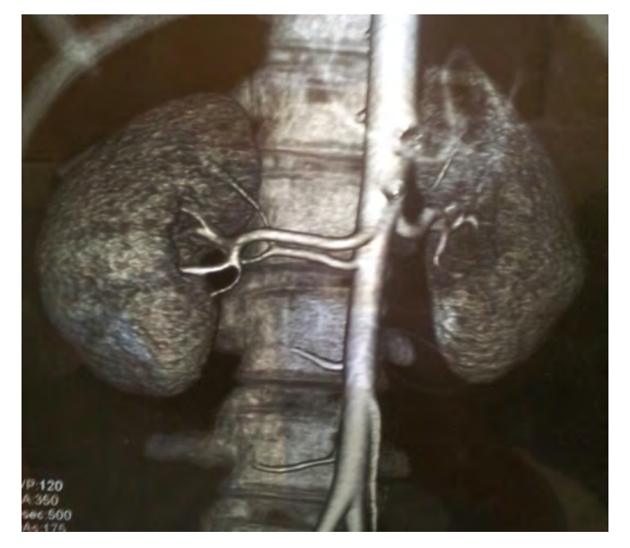
Fig 7: SRA on the right side.