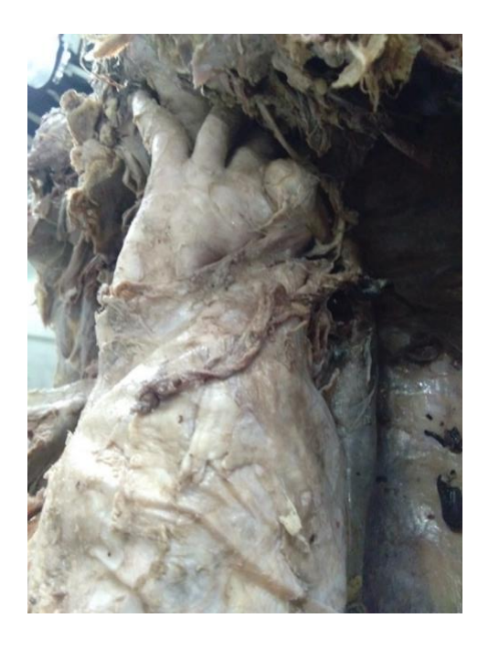
Figure 1: The saccular aneurysm at root of left subclavian artery