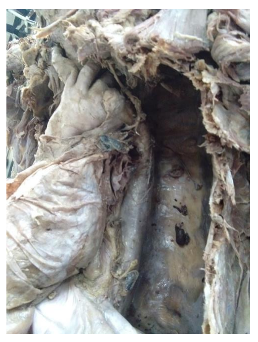
Figure 2: The saccular aneurysm with covering of pericardium