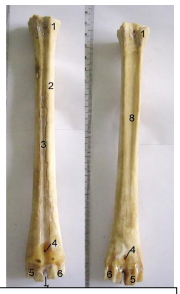
Figure 6: Sitatunga metatarsal (cranial and caudal views). 1, Proximal extremity; 2, Shaft; 3, Metatarsal groove; 4, Nutrient foramen; 5, Lateral condyle; 6, Medial condyle; 7, Intercondyloid groove.