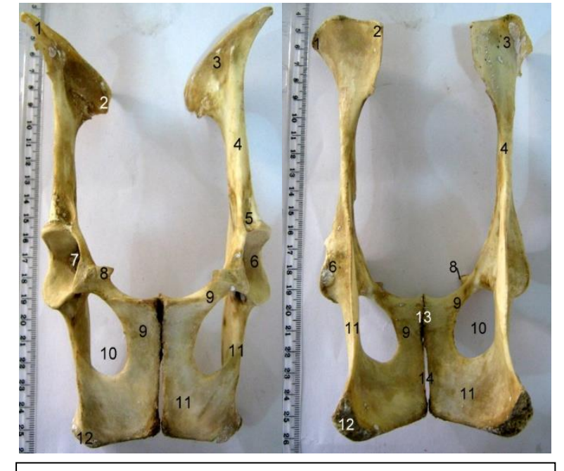
Figure 1: Sitatunga Ossa coxarum (Ventral and dorsal views). 1, Coxal tuber; 2, Sacral tuber; 3, Wing of ilium; 4, Body of Ilium; 5, Fossa; 6, Cotyloid cavity of acetabulum; 7, Acetabular fossa; 8, Iliopubic eminence; 9, Pubis; 10, Obturator foramen; 11, Ischium; 12, Ischial tuber; 13, Pubic symphysis; 13, Ischial symphysis.

A curved trochanteric crest connected the greater trochanter obliquely to the lesser trochanter while creating the trochanteric fossa. The distal extremity presented caudally, the larger lateral condyle and the smaller obliquely directed medial condyle separated by the intercondylar fossa. Cranially, it presented a trochlea with two ridges. The triangular Patella presented a convex dorsal base, ventral apex, concave inner articular surface and convex roughened external surface (Figure 3).