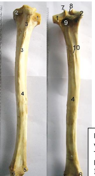
Figure 5: Sitatunga tarsals. 1, Fibula tarsal; 2, Tibia tarsal; 3, Centriquartal; 4, Second and third tarsal fused.

Two Digits having three phalanges were seen on each foot (Figure 7). The first and second Phalanges were small cylindrical bones with shaft and extremities that presented concave proximal surface and convex distal surfaces for articulation. The second phalanx was the shortest of the three bones. The third phalanx of this animal was very unique presenting a long shaped bone triangular with а characteristic sharp pointed end. It presented four surfaces including а cranio-dorsal surface (for concave articulation with the second phalanx), lateral, medial and ground surfaces. Each foot presented six (6) sesamoid bones on their volar surface with two sesamoids placed at the metatarsophalangeal and one at the distal interphalangeal joint of each digit