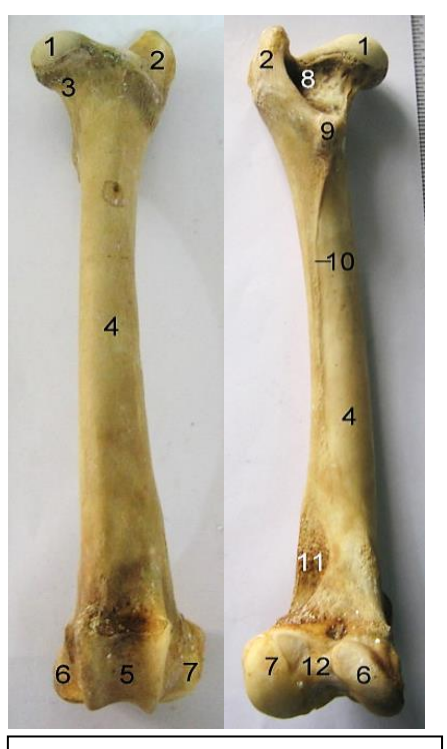
Figure 2: Sitatunga Femur (cranial and caudal views). 1, Head; 2, Greater trochanter; 3, Neck; 4, Shaft; 5, Trochlea; 6, Medial condyle; 7, Lateral condyle; 8, Trochanteric fossa; 9, Lesser trochanter; 10, Muscular line; 11, Supracondyloid fossa 12, Intercondyloid fossa.

Figure 3: Sitatunga Patella. 1, Base; 2, Apex; A, Convex external surface; B, Concave internal surface.