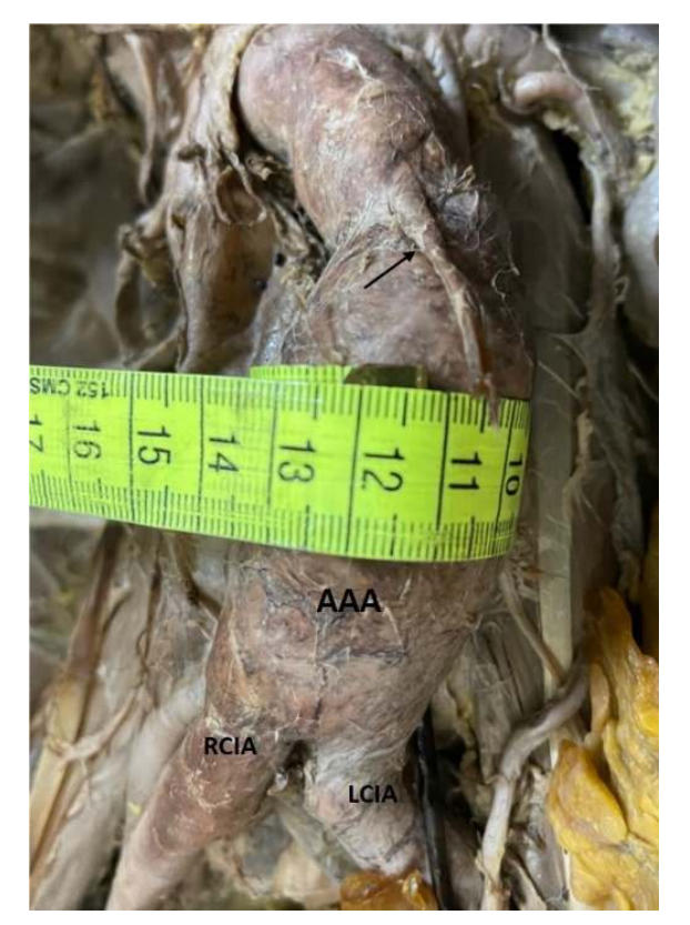
Fig 2. Measurements of abdominal aortic aneurysm below the renal vessels and above the level of bifurcation of aorta (AAA: abdominal aortic aneurysm; IVC; inferior vene cava; Arrow: Inferior mesenteric artery, RCIA: Right common iliac artery, LCIA: Left common iliac artery)

(AAA: abdominal aortic aneurysm; IVC; inferior vene cava; Arrow: Inferior mesenteric artery, RCIA: Right common iliac artery, LCIA: Left common iliac artery)