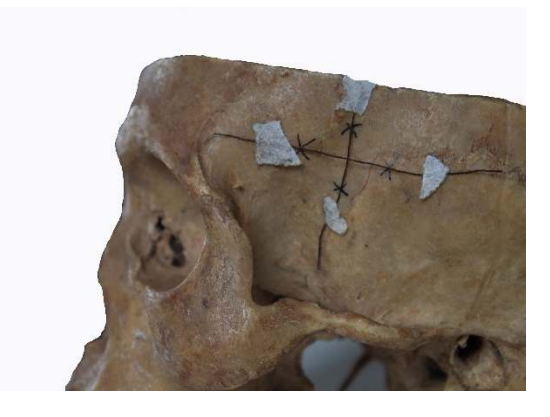
Figure 3: Illustration of the center of pterion in the sphenoparietal type.

In the frontotemporal type, the suture between the frontal and temporal bones was