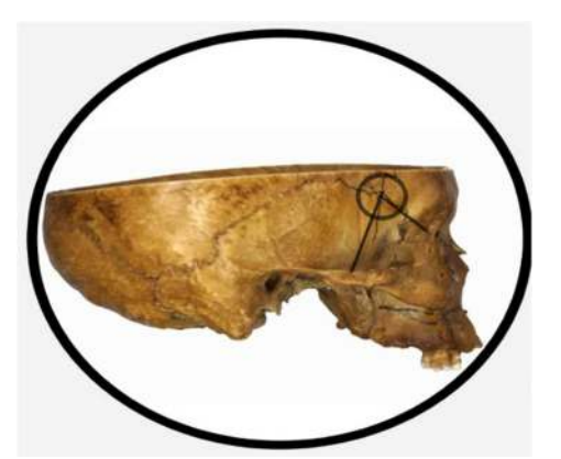
Figure 1: Illustration of how measurements were obtained.

In the sphenoparietal type of pterion, the suture between the sphenoid and parietal bones was used as a segment to determine the centre of pterion. One end of this sphenoparietal suture was taken as centre, a compass was placed here and arcs having more than half the length of the suture were drawn above and below it. Then another end of this sphenoparietal suture was taken as center and arcs were drawn above and below it. The point where both arcs intersected was joined by a thread. The obtained line was again intersected using perpendicular bisectors; the point where both these lines intersected was taken as center of pterion. (see figure 2 and 3)