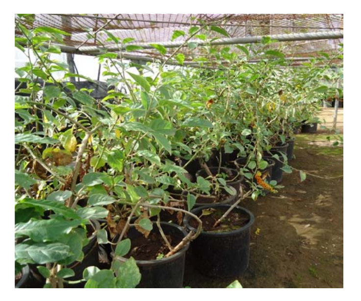
Figure 1. Mother stockplant of P. dodecanda established from seedlings and cuttings under greenhouse condition during experiment, Jimma Agriculture Research Centere.

44 was selected and recommended for further researches for its high composition (25%) of saponins (Lemma et al., 1972; Parkhurst et al., 1974; Legesse, 1993; Lee et al., 1998).