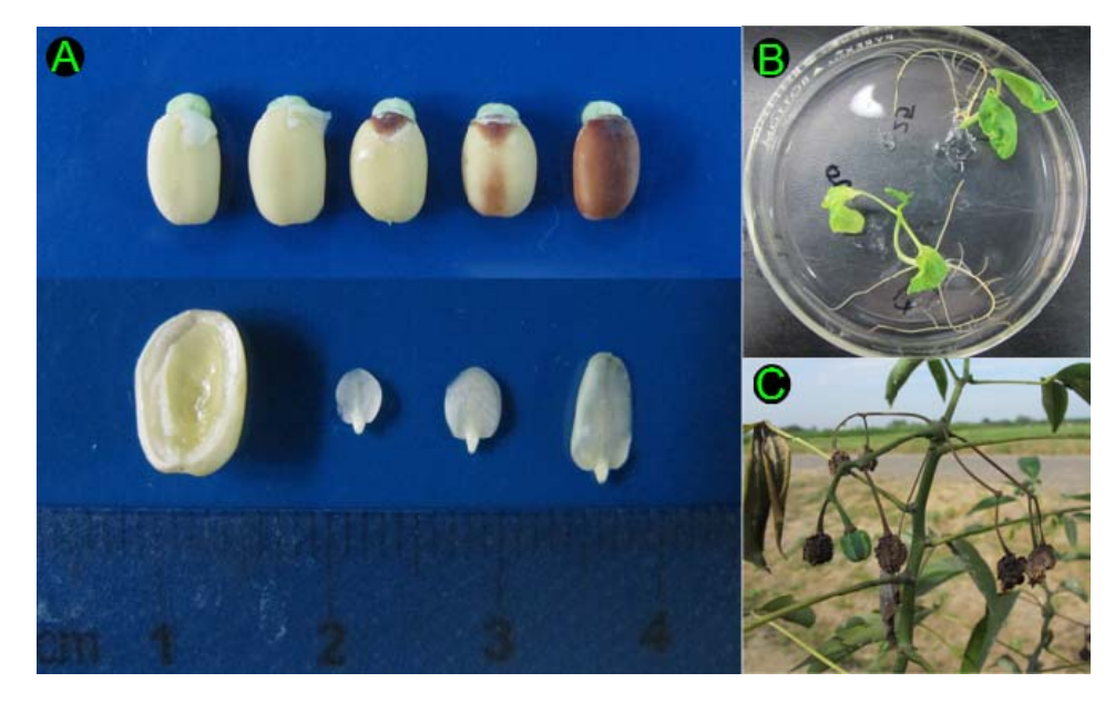
Figure 1. A) Seeds and embryos of cassava (HMC-1) at 30 to 38 days after pollination (DAP). B) Seedlings germinated from young cotyledonary embryos. C) Seeds affected by insects and diseases in the field.

Table 1. Fruit development of different cassava genotypes at different days after pollination (DAP).