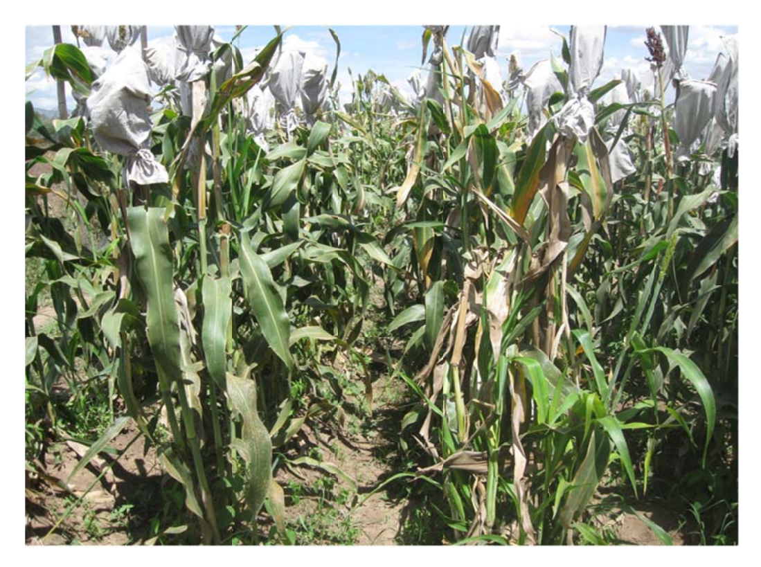
Figure 2. Differences in leaf senescence in the stay-green introgressed line, Meko × B35 (Left) and its recurrent parent Meko (Right) under water deficit condition (to the extreme left is a border row).

Figure 1. Comparison of the sorghum genotypes for grain yield under well watered (I_1) and water deficit (I_0) conditions (bars are standard error of means).