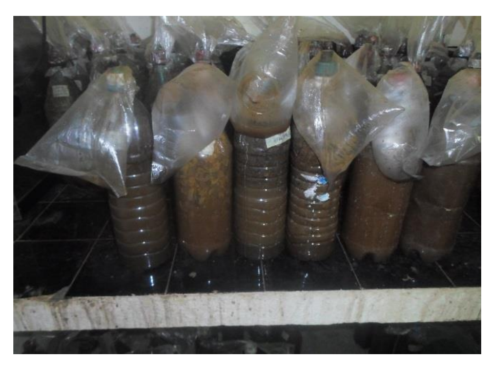
Figure 1. Mini-bioreactors producing biogas from dead neem leaves.