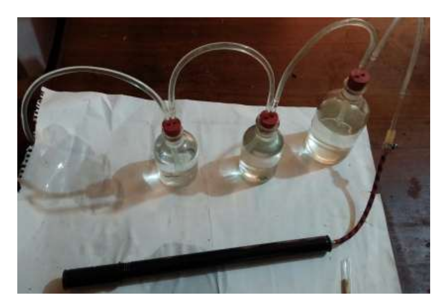
Plate 1. Photograph of assembled pump sampler for shallow water bodies.

b. Connecting tubes for the bottles and pump cut as follows: 30 cm length: six pieces for 5 bottles and the suction pump = 180 cm; used plastic tube (total length) = 252 cm.