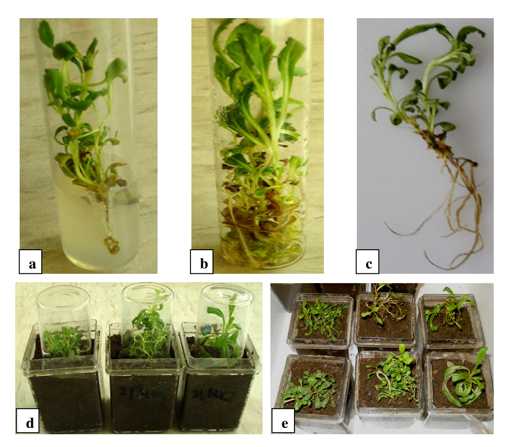
Figure 4. Root induction, hardening and transfer of callus-regenerated plantlets of P. kurroa ; (a) Shoots in rooting medium (b) Root formation (c) Hardening of plantlets (d) Plantlets in pots.

induction of callusing and plant regeneration in tissue cultures. The major differences in the response of different plant species and different explants to tissue culture conditions lies in the ratio of auxins to cytokinins (Skoog and Miller, 1957). High frequency callusing was achieved from root explants as compared to leaf disc