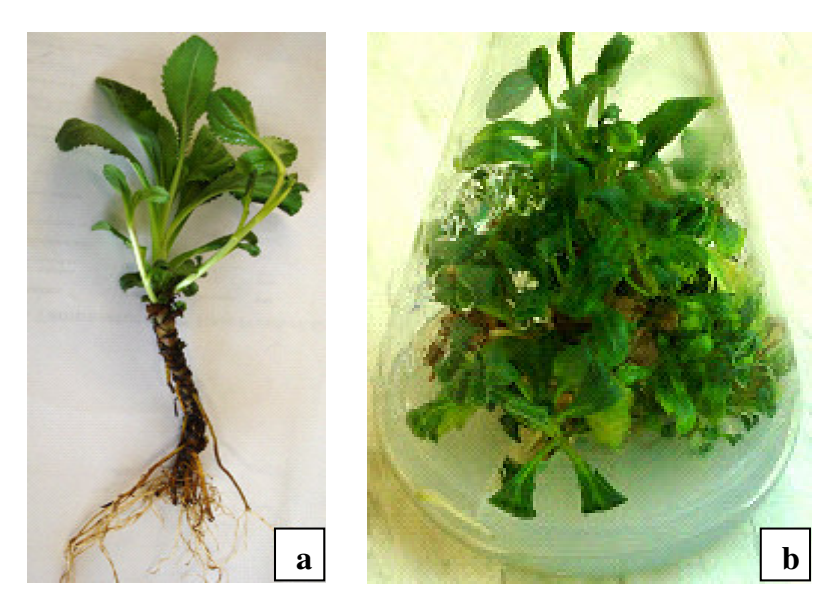
Figure 1. P. kurroa plant from pot (a) and shoot apex-derived in vitro plantlets (b) as sources of explants.