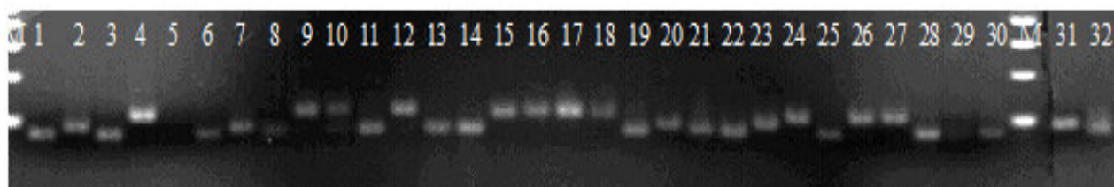
Figure 1. SSR banding pattern of 32 of basmati and aromatic/scented and other non-aromatic indica and japonica varieties of Asian rice generated by primer pair RM1. The lanes represent (M) 25 bp molecular size marker; (1) Basmati-370(P), (2) Mushkan, (3) Basmati-Pak, (4) IR8, (5) Basmati-198, (6) Super-basmati, (7) JP5, (8) Mahlar-346, (9) Purple-marker, (10) Dokri-basmati, (11) IR36, (12) Kinmaze, (13) KangniXTorh, (14) Sonahri-kangni, (15) Kharai-ganga, (16) KSK-133, (17) Shahkar, (18) Shandar, (19) Mehak, (20) Azucena, (21) Kasalath, (22) Basmati-370(I), (23) Dehradun-basmati(I), (24) KDML105, (25) Basmati-217, (26) Dehradun-basmati(N), (27) Punjab-basmati, (28) Pusa-basmati, (29) Chini-Sakkor, (30) Ranbir-basmati, (31) Jasmine-scented, (32) Niaw-hawn-mali.