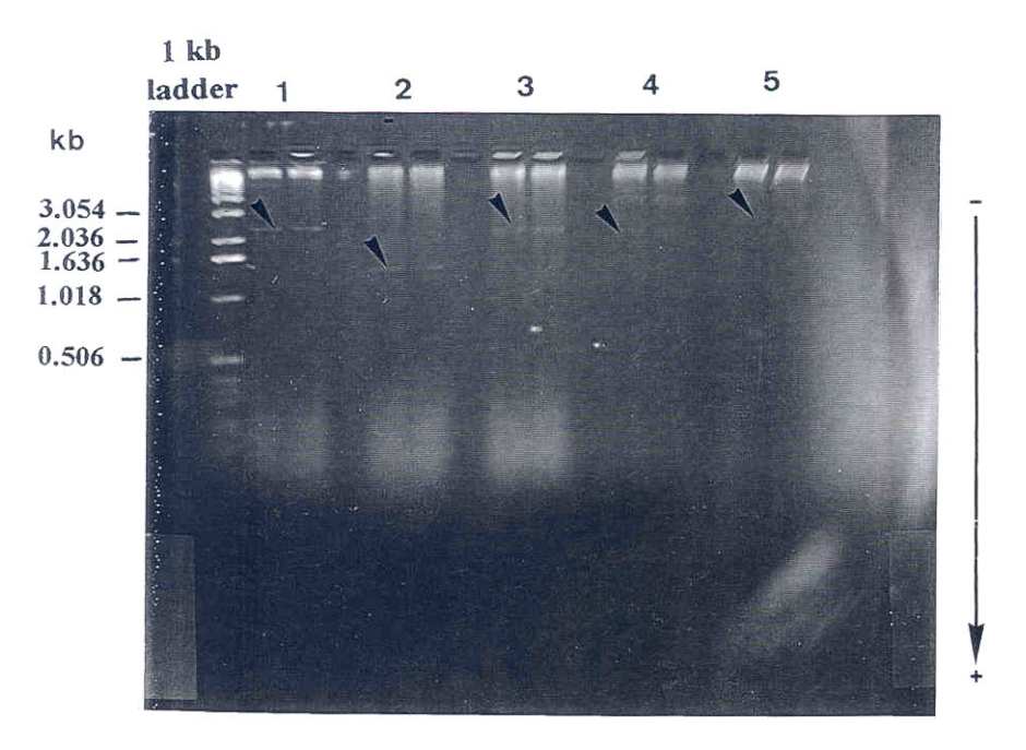
Figure 1A. 1.5% Agarose gel showing the separation of probes after digests of clones, N4 and N6 respectively. Numbers 1 - 5 represent probes generated by double digests 1: BH1 (Xho I/Sal I), 2: BH3 (Xho I/Sac I), 3: BH2 (Xho/Xba I) 4: AC1 (Bgl II/Sac I) and 5: AC2 (Sac I/Sal I). The arrows indicate the 2.2 and 1.4 kb fragment bands that were excised.

However, only two types of clones were isolated and were described as N4 and N6. The two clones differed from each other by the size of inserts and they both hybridized with the 1.8 kb A2 probe and the 1.3 kb B1 probe; revealing that both N4 and N6 clones contained A2 and B2 esterase genes.